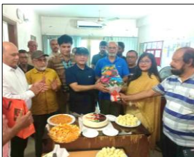
Birthday Celebration of Managing Director