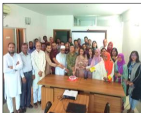
Annual Feast Celebration